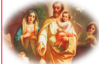
The Church dedicates the month of March to St. Joseph